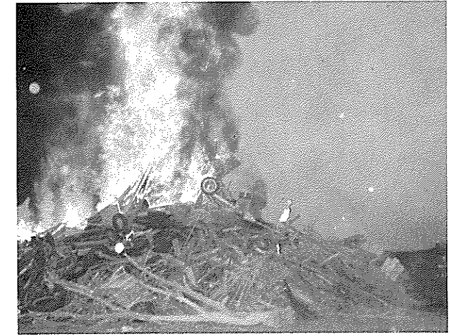
Burning of the bonfire