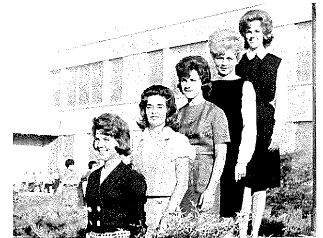
Homecoming Queen Nominees