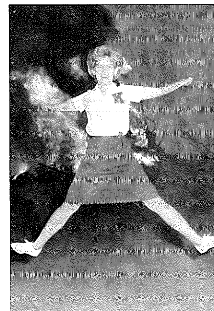
Cheerleader leads yells at the bonfire.

Homecoming is looked forward to each year by all the students in Kermit High. For weeks the students gather wood for the bonfire. In the pep rally the exes return and school colors are pinned on the boys and faculty. Five girls are selected as nominees for Homecoming queen. The queen is revealed at the football game where she is crowned.